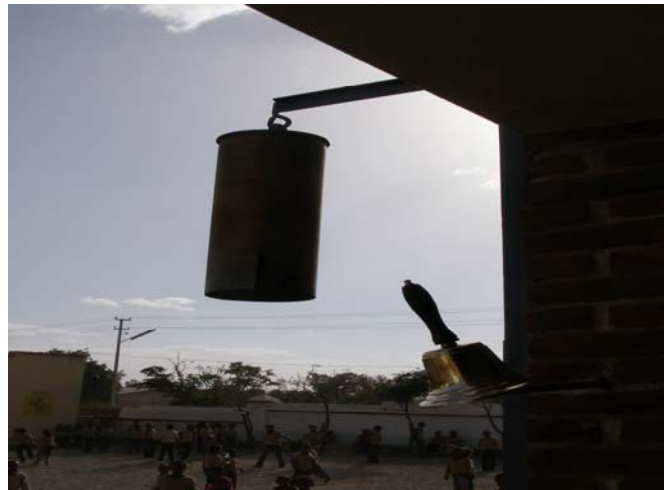
This hanging remnant of war will be taken down to be replaced by the newly acquired bells.

The use of explosive remnants of war in the daily economic lives of Eritreans in mine impacted communities is common, sometimes as agricultural tools, household utensils, decorations or school bells, and sometimes sold in markets.