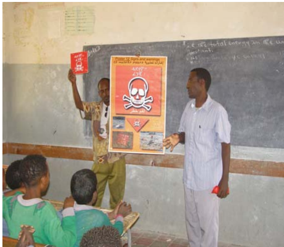
Donor representatives observe a mine risk education session