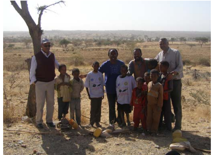
School children appreciate the bells