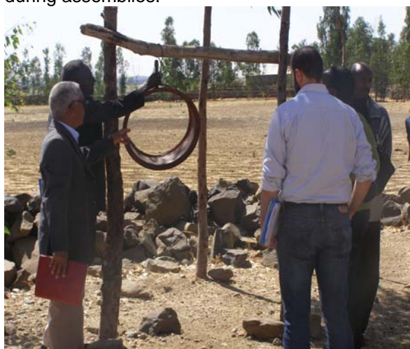
The ERW used as a school bell is removed.

This was a life saving intervention for over 550,000 school children, teachers and parents, as the majority of schools, particularly in the war-affected communities use explosive remnants of war as school bells and accidents have occurred during assemblies.